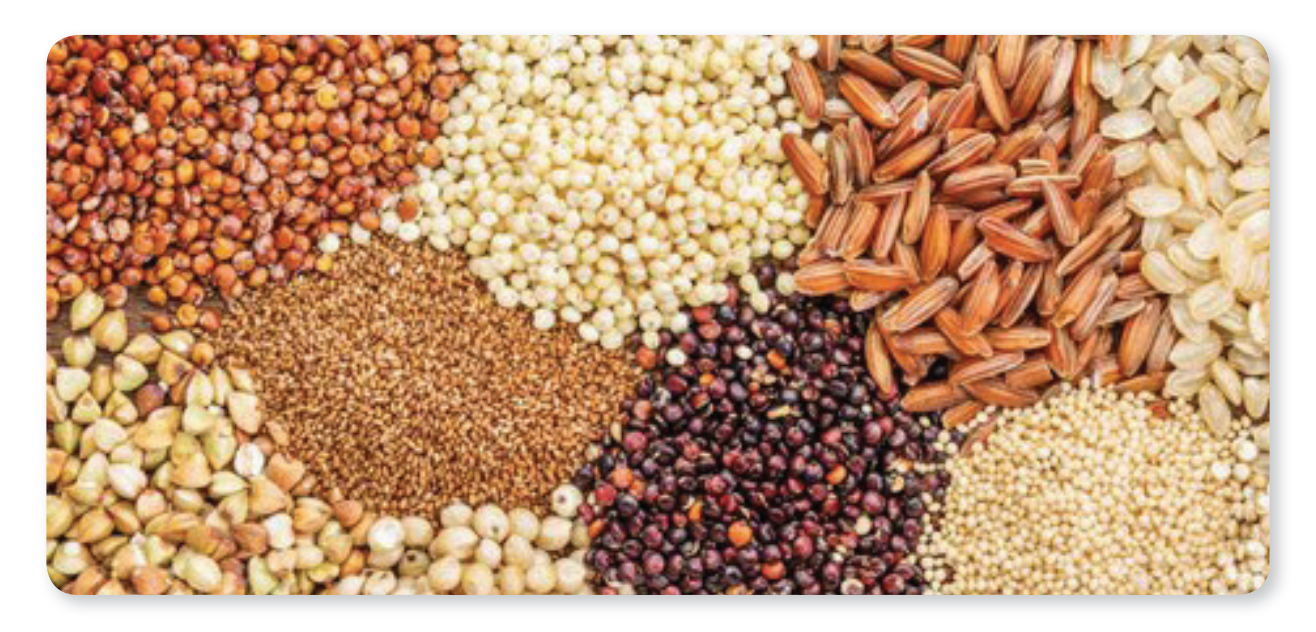
Total Production – All Seasons: Foodgrains (000 Tonnes)

While in 2018-19, the total food grains production was 9,275.2 (000 tonnes), cereals 8835.1 (000 tonnes) and pulses 440.1 (000 tonnes), in 2019-20, the total production of food grains went up to 11,125 (000 tonnes), cereals 10,575.9 (000 tonnes) and pulses 549.2 (000 tonnes). As per the initial reports, the food grain production is estimated to be over 17.1 million tons in 2020-21, recording an ever higher growth of 53.7 per cent. During the same period, the state had also seen a 54.7 per cent increase in oilseeds production. Oilseeds output stood at 0.98 million tons in 2020-21.